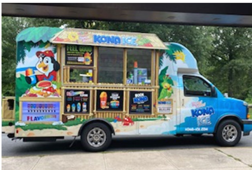
Surprise Ending for VBS – Hawaiian Ices for everyone!!