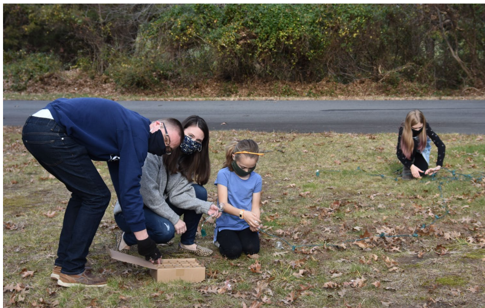
Foleys at Saint Lucia Festival