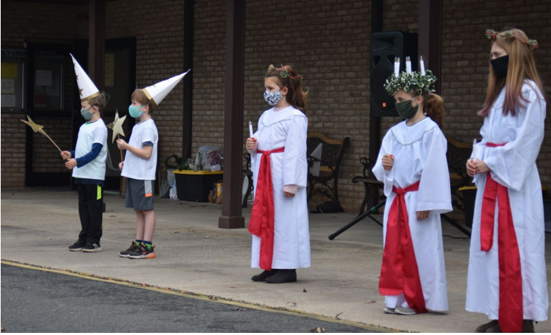
Santa Lucia Lineup