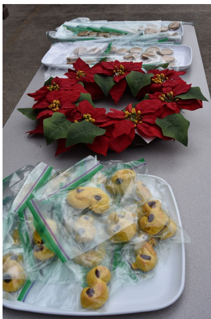
Santa Lucia Buns and Pepparkakor cookies